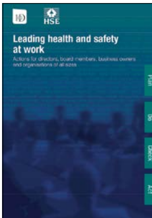
This is a web-friendly version of leaflet INDG417(rev1), published 06/13

Actions for directors, board members, business owners and organisations of all sizes